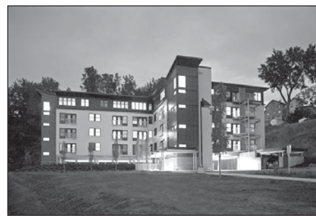
Champlain Housing Trust in Burlington, Vermont, is the largest community land trust in the USA with over 2,000 units of resale-restricted, owner-occupied housing and nonprofit rental housing in its portfolio.

or other nonprofit, governmental or for-profit entities. The ground leases used by a community land trust last for a very long time, typically for 99 years, with the community land trust collecting a modest monthly fee for the use of each leasehold.