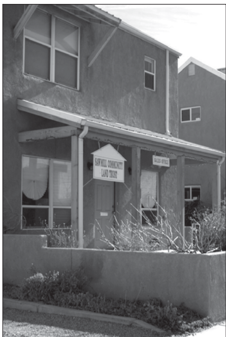
Above and opposite: a large-scale inner-city redevelopment project completed by the Sawmill Community Land Trust in Albuquerque, New Mexico, USA.

cated on its land, should their owners ever choose to sell. The resale price is determined by a formula contained in the ground lease. This formula, which usually yields a resale price that is much lower than the building's market value, is designed to give the seller a fair return for his or her investment, while giving a future buyer fair access to a home or commercial space at an affordable price. By design and by intent, the community land trust is committed to preserving the affordability of housing (and other structures) one owner after another, in perpetuity.